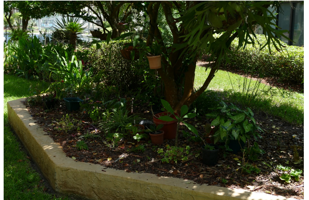
No Theme or Uniformity