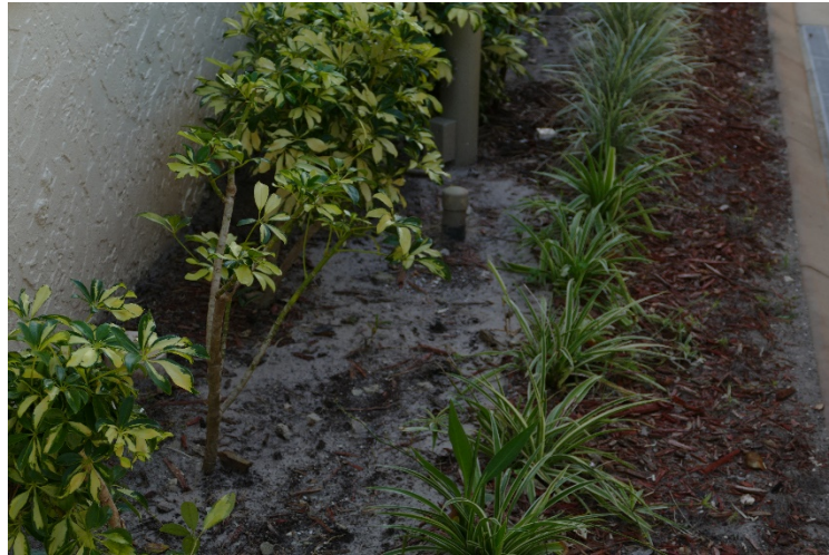
Erosion on the Drip Line!