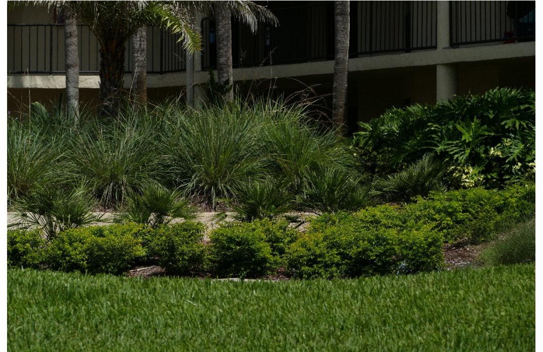
Front of the Vistas